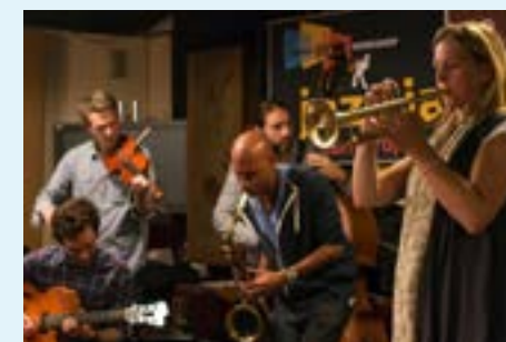
13 jam sessions at the Stanford Coffee House