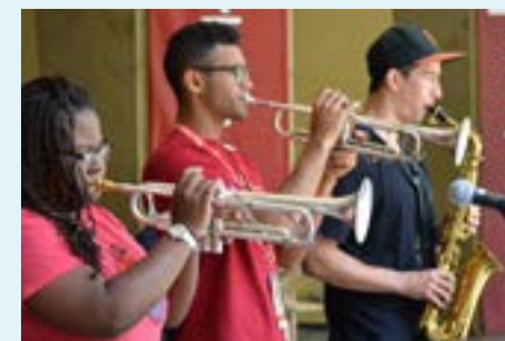
9 noontime concerts on White Plaza at Stanford