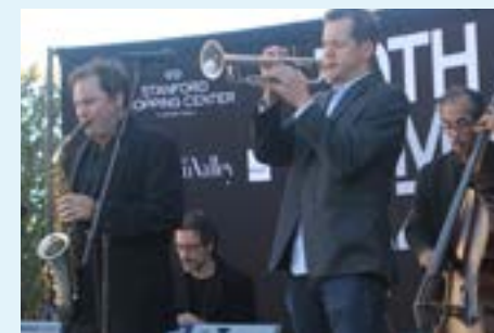
SJW Faculty All-Stars concert at Stanford Shopping Center